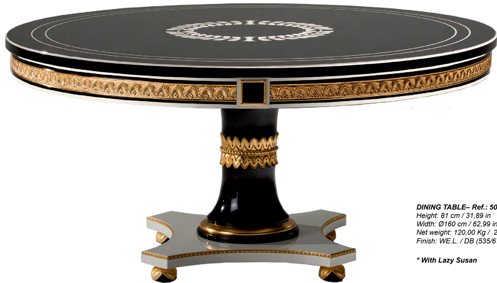
DINING TABLE– Ref.: 50272.0 Height: 81 cm / 31,89 in Width: Ø160 cm / 62,99 in Net weight: 120,00 Kg / 264,32 lb Finish: WE.L. / DB (535/67)