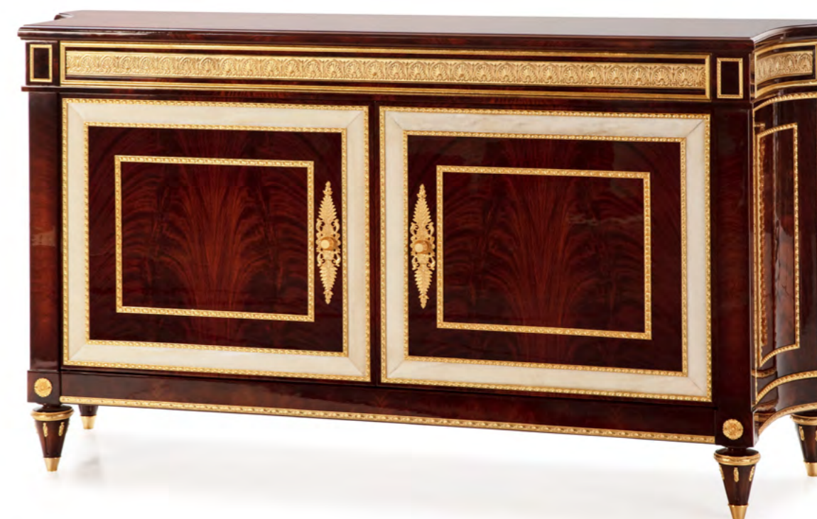
◀ CABINET – Ref.: 50520.0 Height: 220 cm / 86,61 in Width: 175 cm / 68,9 in Depth: 50 cm / 19,69 in Net weight: 220,00Kg / 484,58 lb Finish: CAMD.B.POE/ OA (524/231)