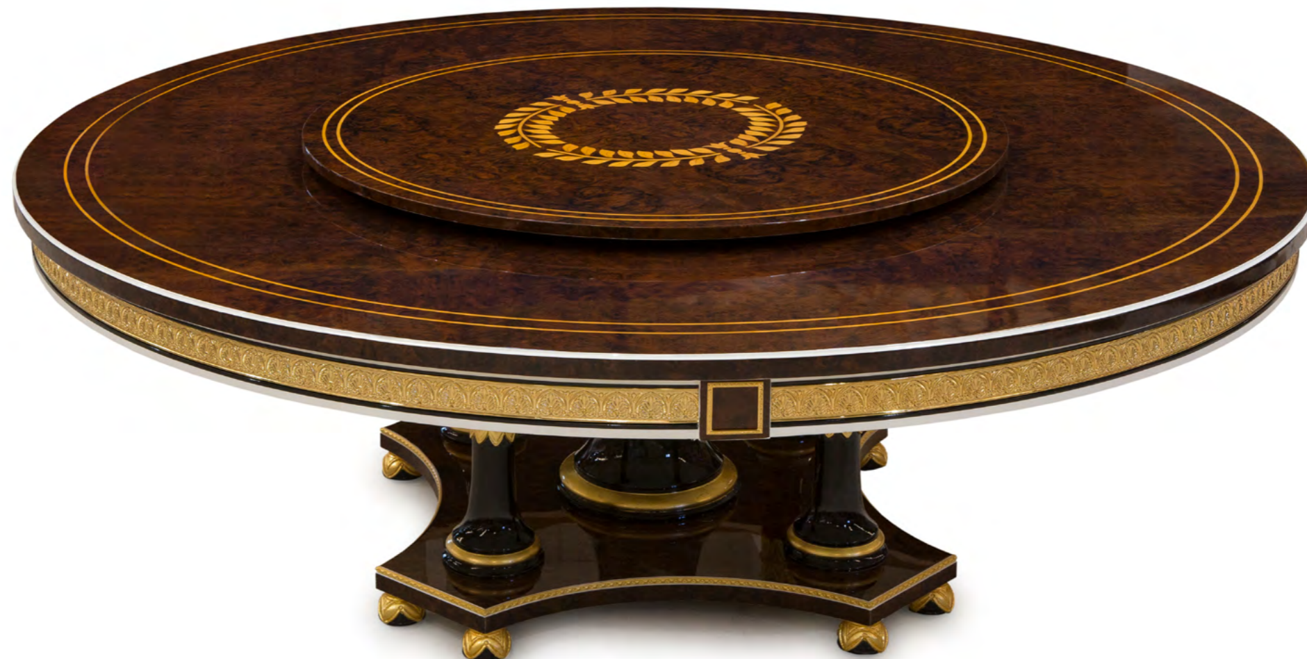
DINING TABLE – Ref.: 50496.2 Height: 81 cm / 31,89 in Width: Ø 220 cm / 86,61 in Net weight: 210,00 Kg / 462,56 lb Finish: WE.W. / DB (536/67)