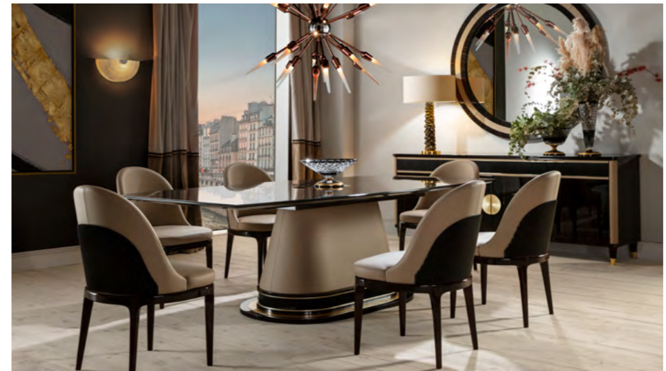
1. MONACO COLLECTION ..... PAGE 150