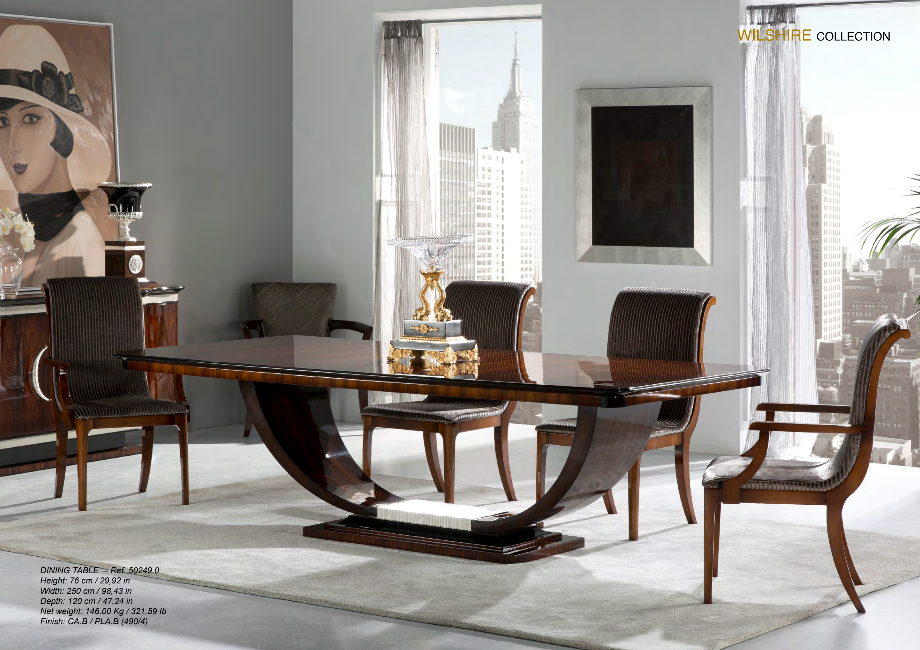
DINING TABLE – Ref. 50249.0 Height: 76 cm / 29,92 in Width: 250 cm / 98,43 in Depth: 120 cm / 47,24 in Net weight: 146,00 Kg / 321,59 lb Finish: CA.B / PLA.B (490/4)