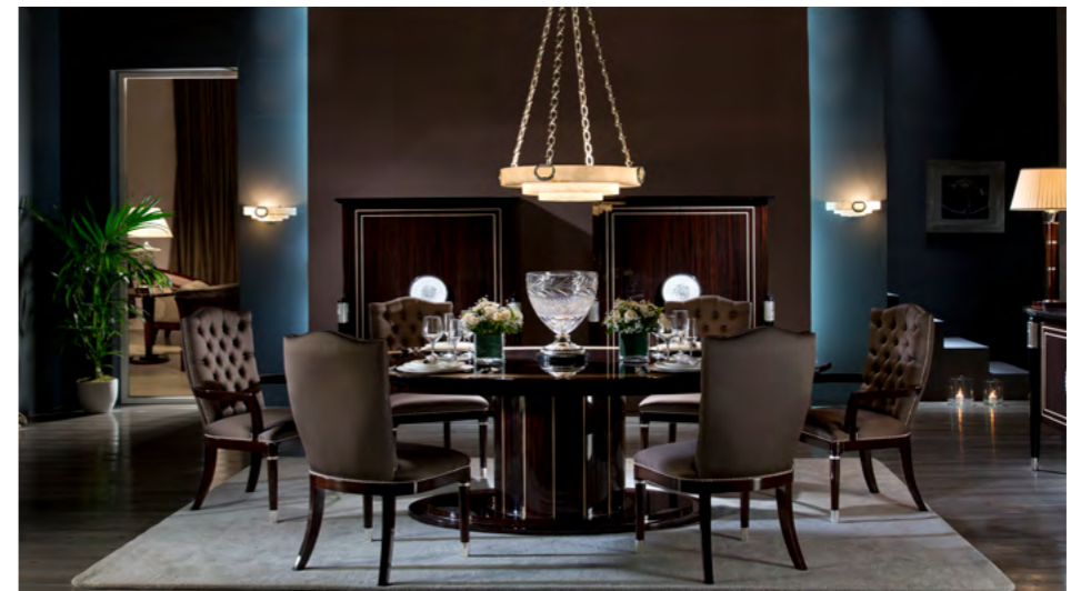
2. GATSBY COLLECTION ..... PAGE 172