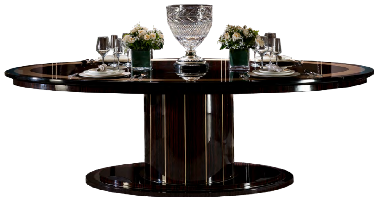
DINING TABLE – Ref. 50241.0 Height: 77 cm / 30,31 in Width: 250 cm / 98,43 in Depth: 150 cm / 59,06 in Net weight: 176,00 Kg / 387,67 lb Finish: MAK.B / AC.B (486/477)