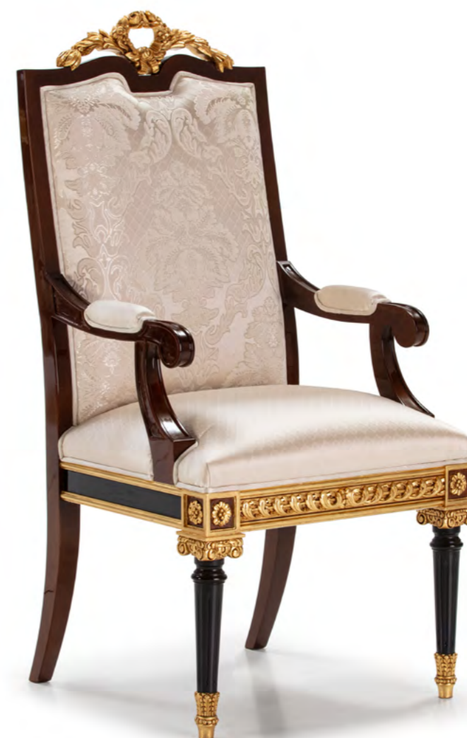
ARMCHAIR – Ref.: 50600.0 Height: 119 cm / 46,85 in Width: 59 cm / 23,23 in Depth: 60 cm / 23,62 in Net weight: 11,00Kg / 24,25 lb Finish: NON.POE / OA (584/231)