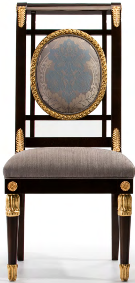
CHAIR – Ref.: 50481.0 Height: 112 cm / 44,09 in Width: 54 cm / 21,26 in Depth: 61 cm / 24,02 in Net weight: 12,00 Kg / 26,43 lb Finish: N.A.B / OA (515/231)