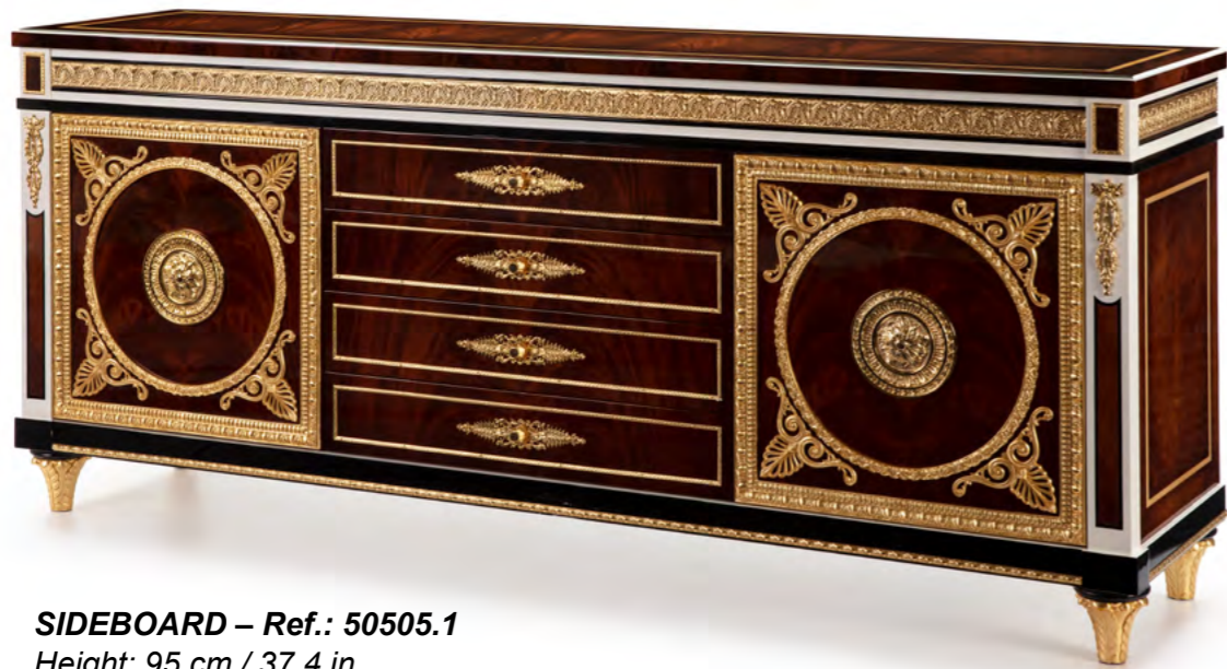
SIDEBOARD – Ref.: 50505.1