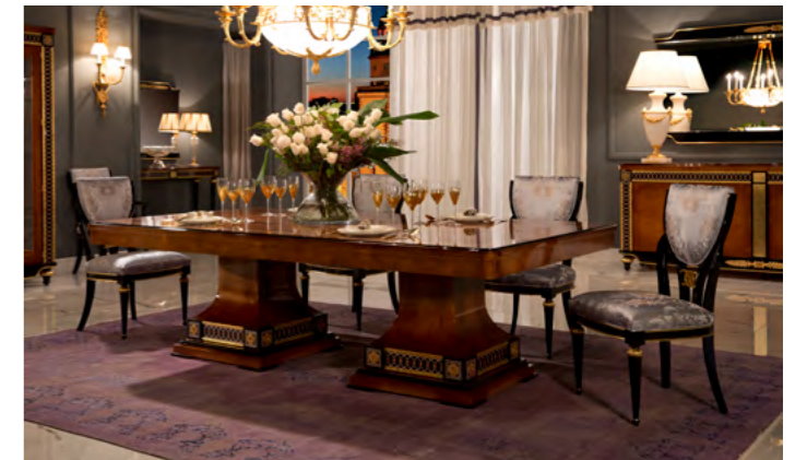
6. NANTES (page 114)