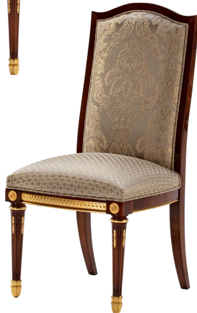
CHAIR – Ref.: 50521.0 Height: 112 cm / 44,09 in Width: 60 cm / 23,62 in Depth: 65 cm / 25,59 in Net weight: 11,00Kg / 24,23 lb Finish: CAMD.B. POE/OA (524/231)