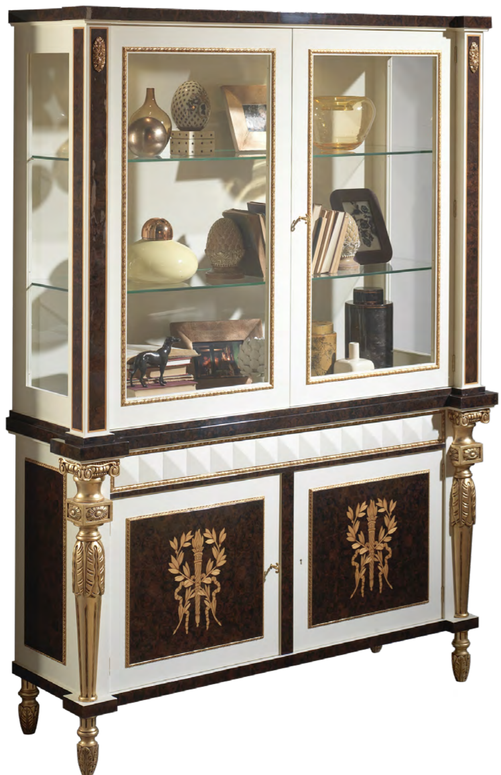
CABINET – Ref.: 50033.0 Height: 210 cm / 82,68 in Width: 154 cm / 60,63 in Depth: 51 cm / 20,08 in Net weight: 224,00 Kg / 493,39 lb Finish: BEL. / OF (488/55)