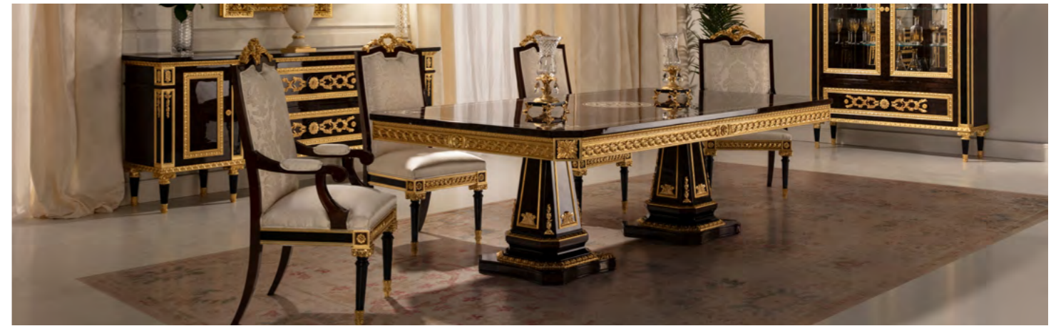
1. TRIANON (page 6)