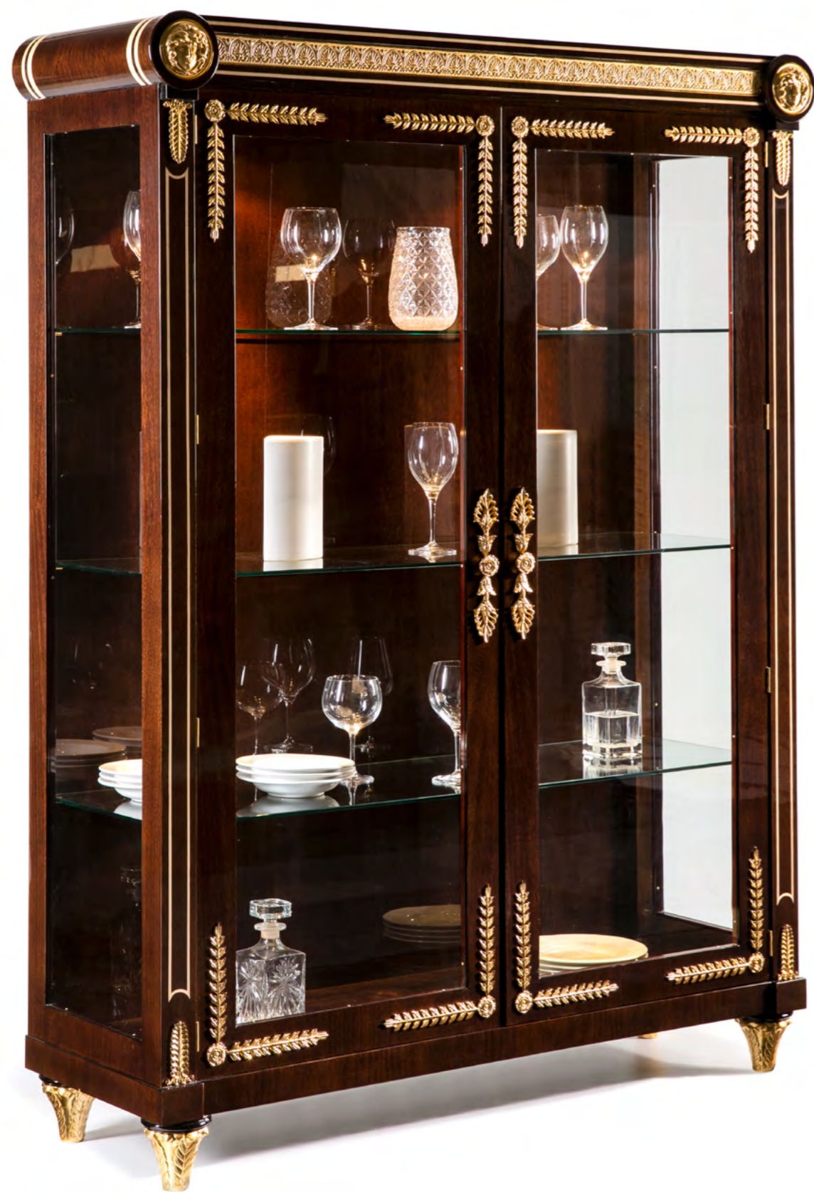
CABINET – Ref.: 50480.0 Height: 203 cm / 79,92 in Width: 150 cm / 59,06 in Depth: 52 cm / 20,47 in Net weight: 149,00 Kg / 328,19 lb Finish: N.A.B / OA (515/231)