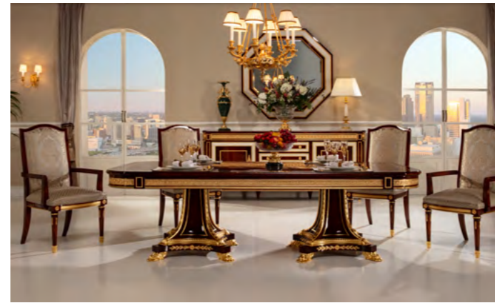
2. LANCASTER (page 24)