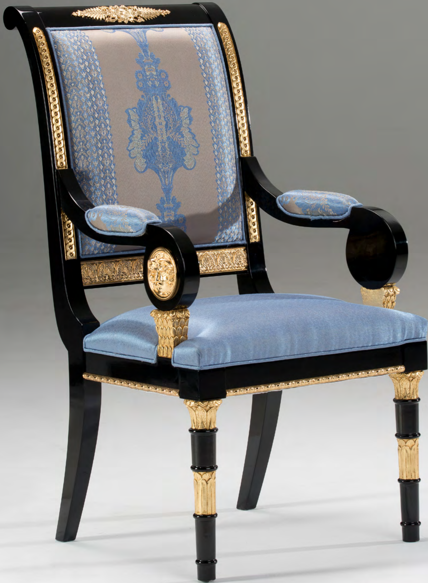
ARMCHAIR – Ref.: 50277.0 Height: 110 cm / 43,31 in Width: 61 cm / 24,02 in Depth: 68 cm / 26,77 in Net weight: 14,00 Kg / 30,84 lb Finish: POE/NB / DB (425/67) Fabric: 241.157 / 241.158