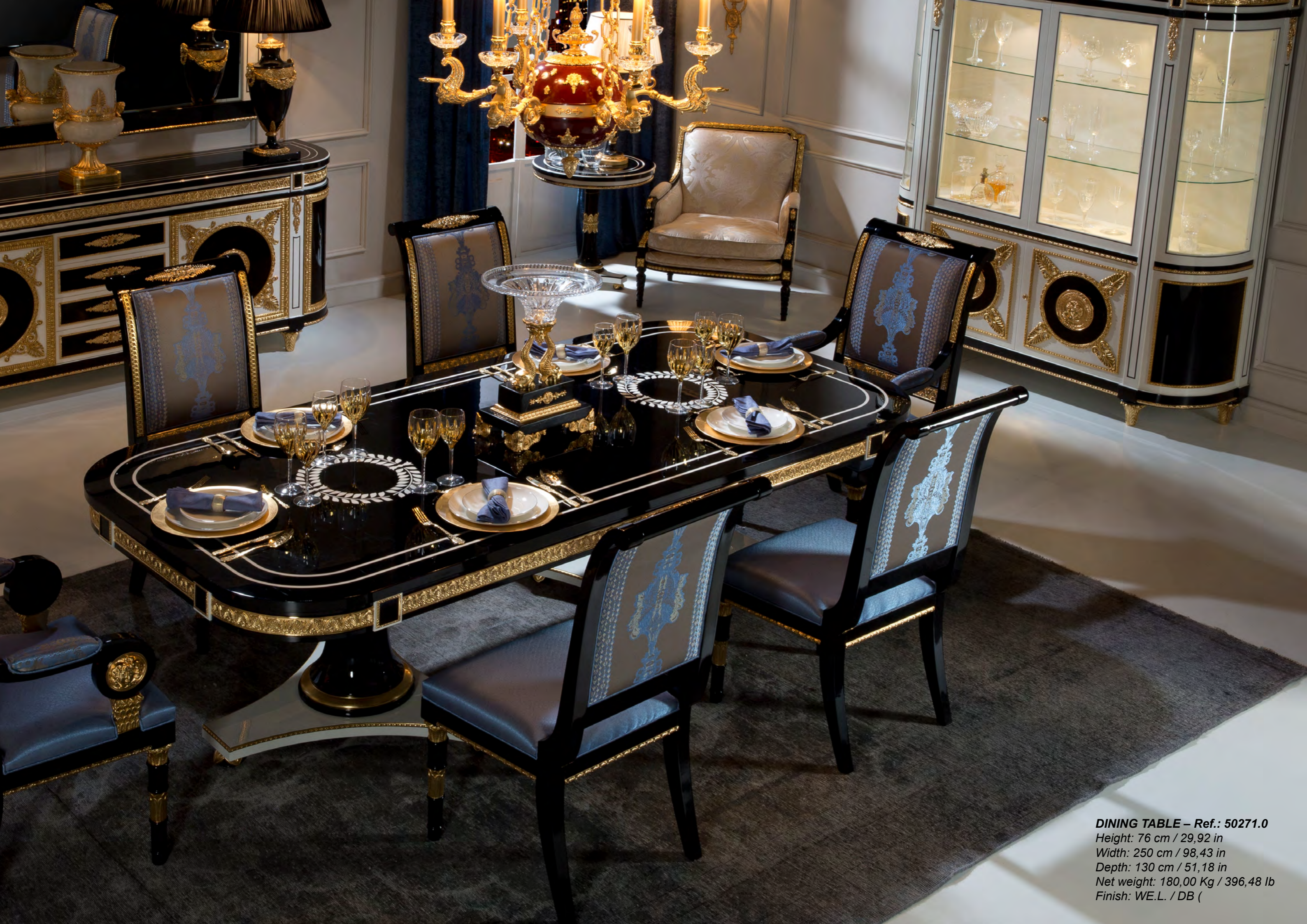
DINING TABLE – Ref.: 50271.0 Height: 76 cm / 29,92 in Width: 250 cm / 98,43 in Depth: 130 cm / 51,18 in Net weight: 180,00 Kg / 396,48 lb Finish: WE.L. / DB (