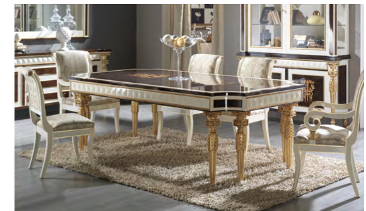
7. BELGRAVIA (page 132)