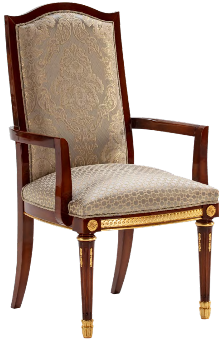
ARMCHAIR – Ref.: 50522.0 Height: 112 cm / 44,09 in Width: 60 cm / 23,62 in Depth: 68 cm / 26,77 in Net weight: 13,00Kg / 28,63 lb Finish: CAMD.B. POE/OA (524/231)