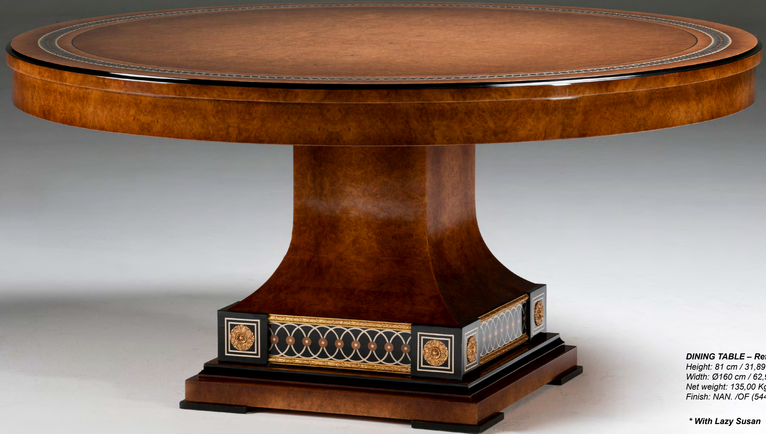
DINING TABLE – Ref.: 50340.0 Height: 81 cm / 31,89 in Width: Ø160 cm / 62,99 in Net weight: 135,00 Kg / 297,36 lb Finish: NAN. /OF (544/55)