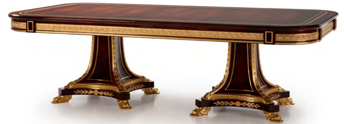
DINING TABLE – Ref.: 50515.0 Height: 76 cm / 29,92 in Width: 250 cm / 98,43 in Depth: 130 cm / 51,18 in Net weight: 180,00Kg / 396,48 lb Finish: CAMD.B. POE/OA (524/231)