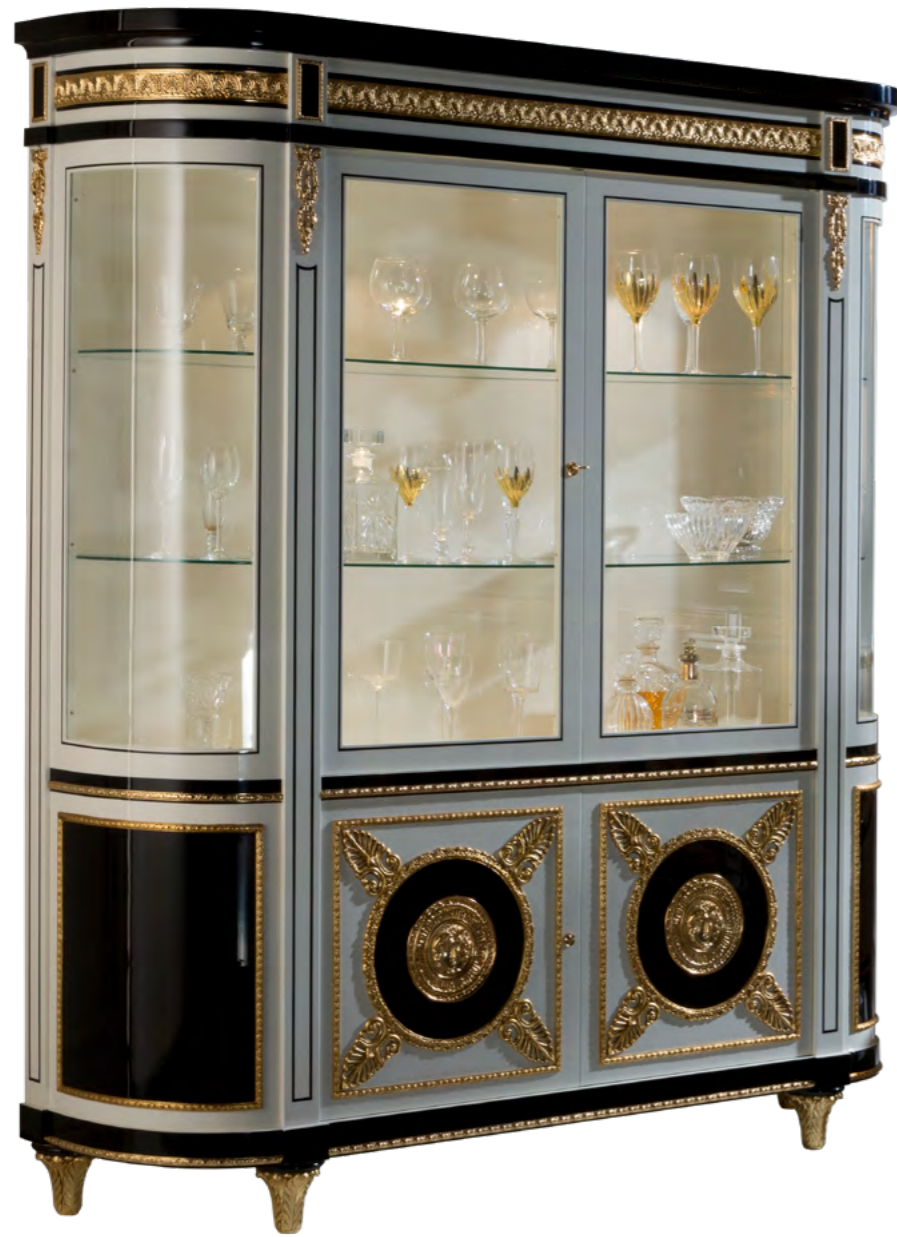
CABINET - Ref.: 50275.0 Height: 206 cm / 81,1 in Width: 178 cm / 70,08 in Depth: 49 cm / 19,29 in Net weight: 186,00 Kg / 409,69 lb Finish: WE.L / DB (535/67)