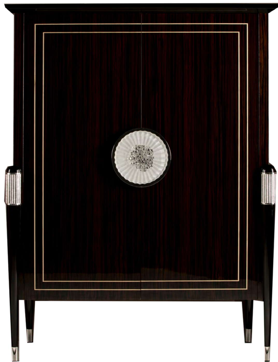
CABINET – Ref. 50242.0 Height: 172 cm / 67,72 in Width: 131 cm / 51,57 in Depth: 50 cm / 19,69 in Net weight: 135,00 Kg / 297,36 lb Finish: MAK.B / PL.B / AC.B (486/531)