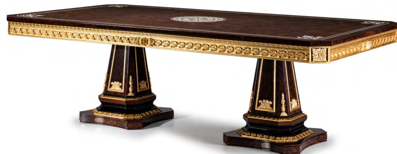
DINING TABLE – Ref.: 50595.0 Height: 77 cm / 30,32 in Width: 250 cm / 98,43 in Depth: 135 cm / 53,15 in Finish: Finish: NON.POE / OA (584/231)