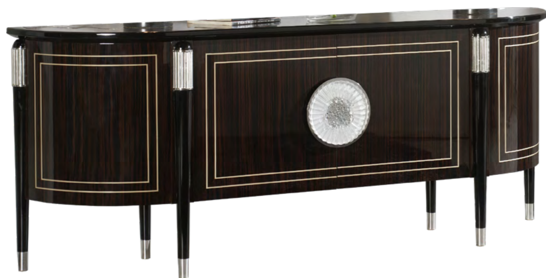
MIRROR – Ref. 50214.0 Width: Ø130 cm / 51,18 in Depth: 8 cm / 3,15 in Net weight: 32,00 Kg / 70,48 lb Finish: MAK.B (486) Leather: 250.001