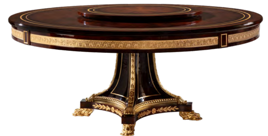
DINING TABLE – Ref.: 50516.0 Height: 81 cm / 31,89 in Width: 160Ø cm / 62,99 in Net weight: 120,00Kg / 264,32 lb Finish: CAMD.B. POE/OA (524/231)