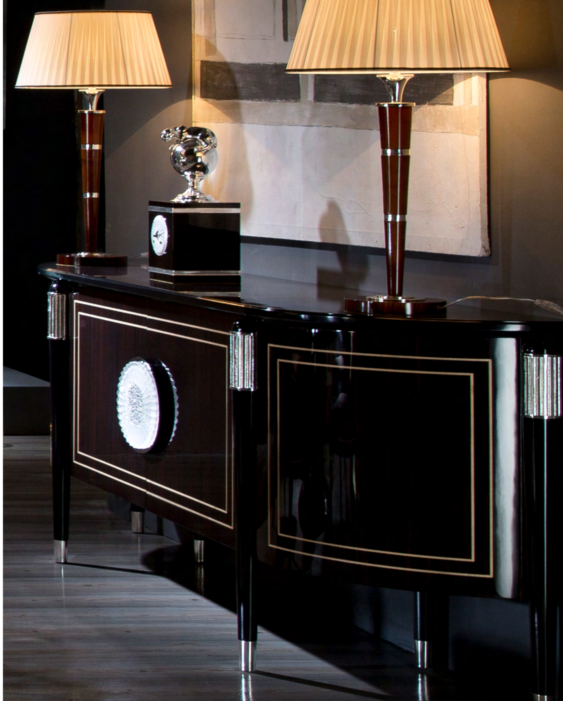
SIDEBOARD – Ref. 50221.0 Height: 95 cm / 37,4 in Width: 240 cm / 94,49 in Depth: 50 cm / 19,69 in Net weight: 140,00 Kg / 308,37 lb Finish: MAK.B / PLA.B / AC.B (486/531)