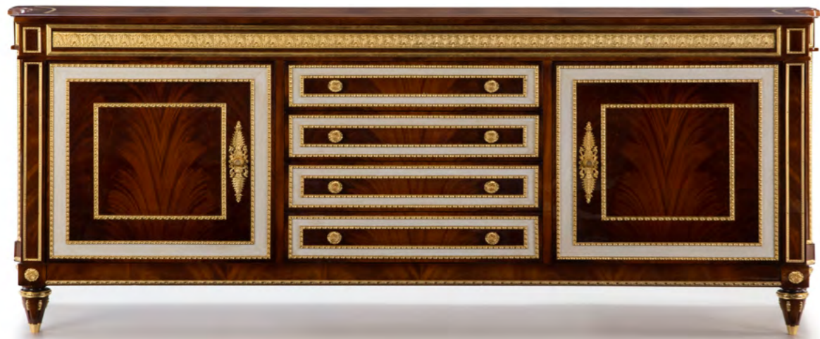
SIDEBOARD – Ref.: 50517.0 Height: 96 cm / 37,4 in Width: 240 cm / 94,49 in Depth: 50 cm / 19,69 in Net weight: 210,00Kg / 462,56 lb Finish: CAMD.B. POE/OA (524/231)