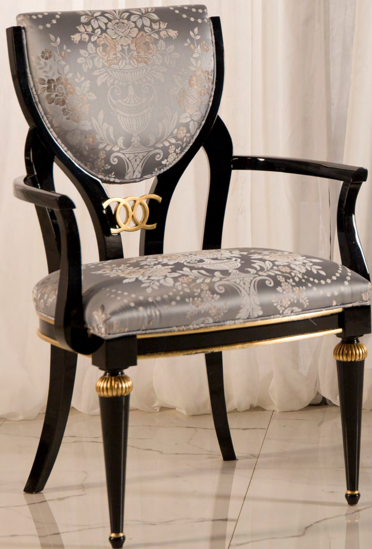
CHAIR – Ref.: 50344.0 Height: 97 cm / 38,19 in Width: 55 cm / 21,65 in Depth: 58 cm / 22,83 in Net weight: 7,00 Kg / 15,42 lb Finish: NAN. (544) Suggested Fabric: 241.185