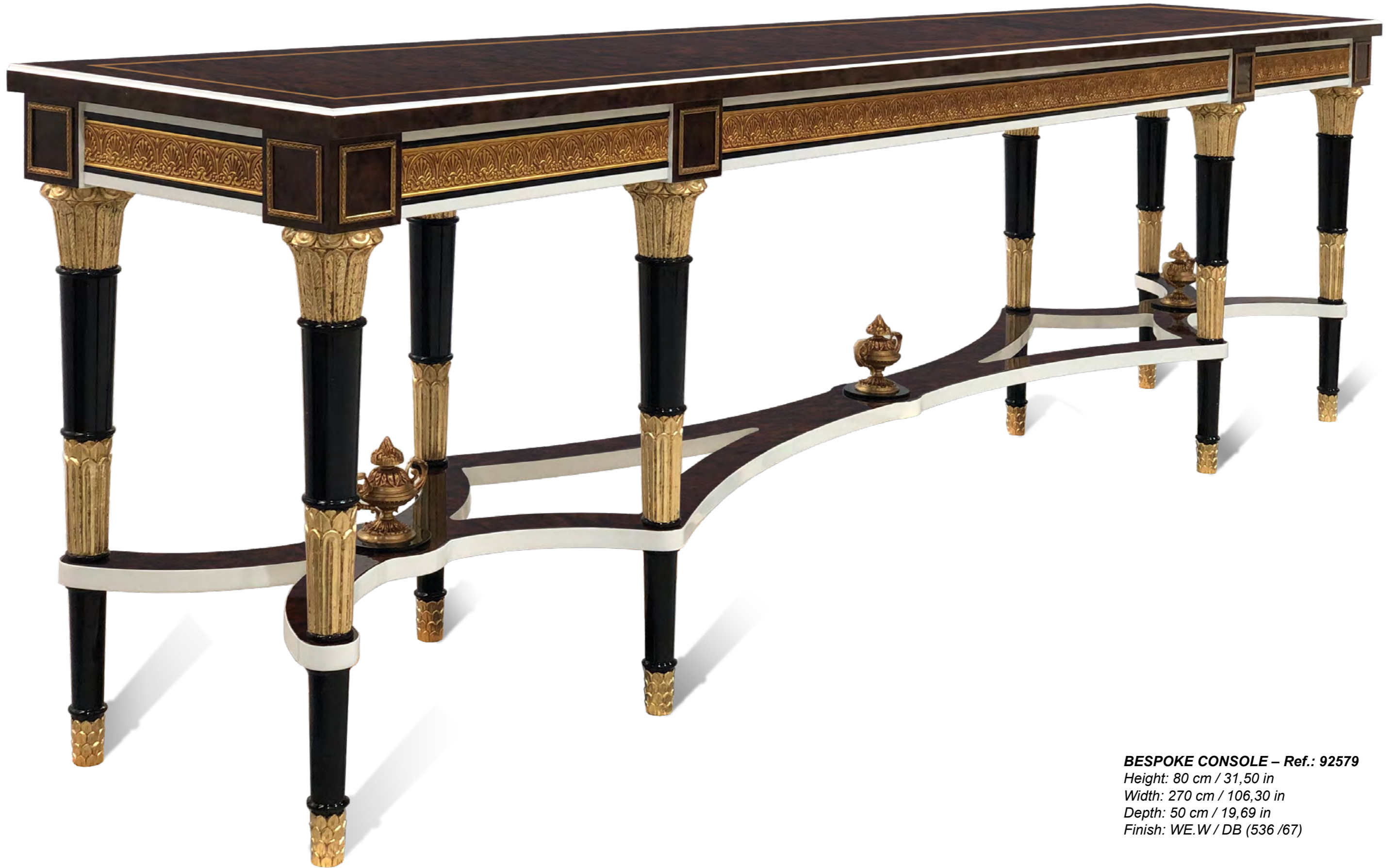
BESPOKE CONSOLE – Ref.: 92579 Height: 80 cm / 31,50 in Width: 270 cm / 106,30 in Depth: 50 cm / 19,69 in Finish: WE.W / DB (536 /67)