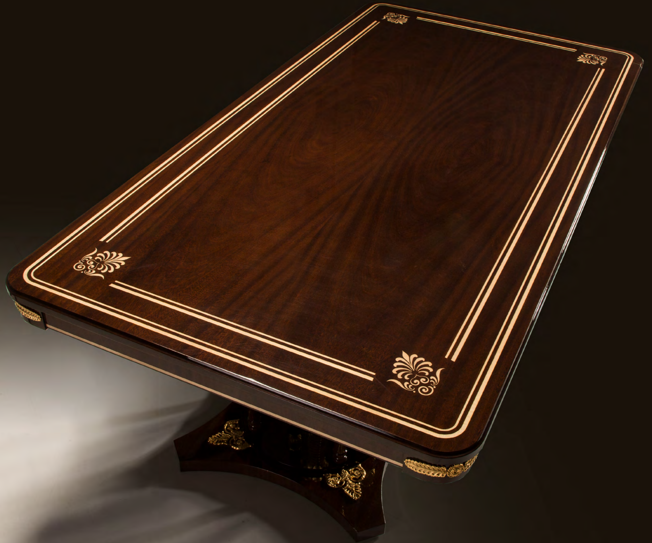
DINING TABLE – Ref.: 50477.0 Height: 78 cm / 30,71 in Width: 250 cm / 98,43 in Depth: 130 cm / 51,18 in Net weight: 208 ,00 Kg / 458,15 lb Finish: N.A.B / OA (515/231)