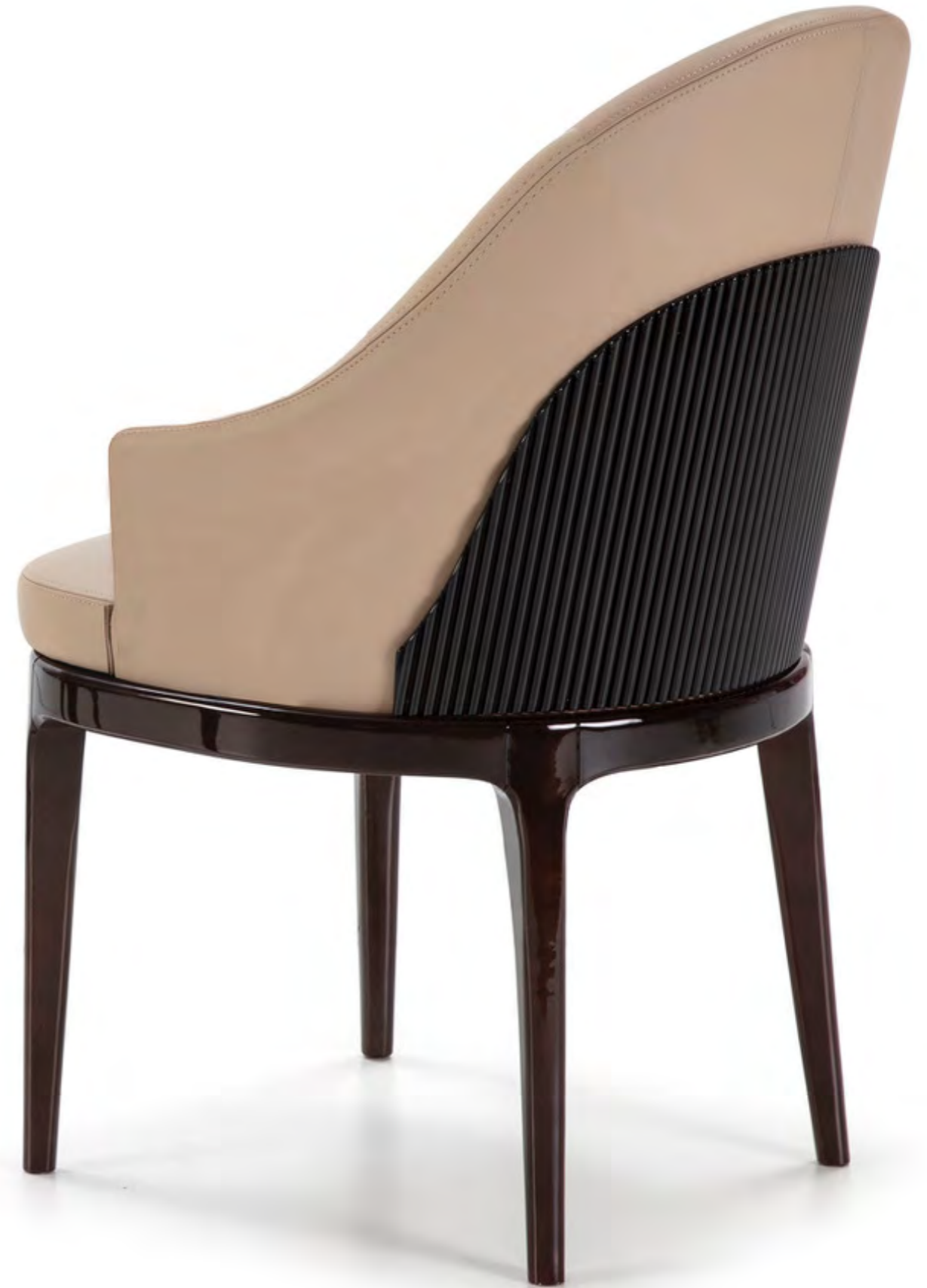
ARMCHAIR – Ref.: 50584.0 Height: 89 cm / 35,04 in Width: 56 cm / 22,05 in Depth: 58 cm / 22,83 in Net weight: 10,00 Kg / 22,03 lb Finish: MAK.B/NB (598)