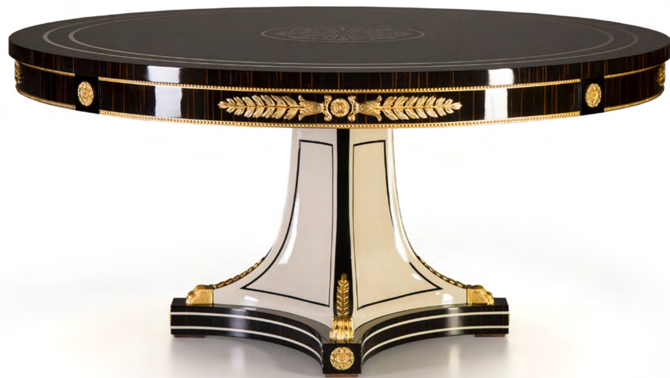
DINING TABLE – Ref.: 50431.0 Height: 81 cm / 31,89 in Width: Ø160 cm / 62,99 in Net weight: 110,00 Kg /242,29 lb Finish: MAM. /OA (560/231)