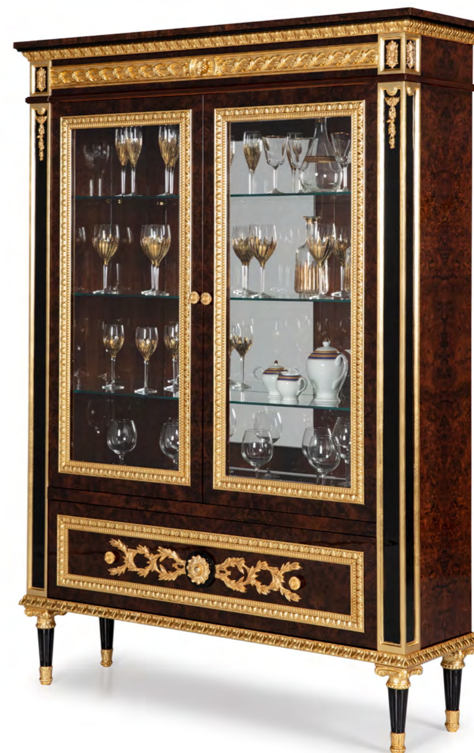
CABINET- Ref.: 50598.0 Height: 215 cm / 84,65 in Width: 154 cm / 60,63 in Depth: 45 cm / 17,72 in Net weight: 213,00Kg / 83,86 lb Finish: NON.POE / OA (584/231)