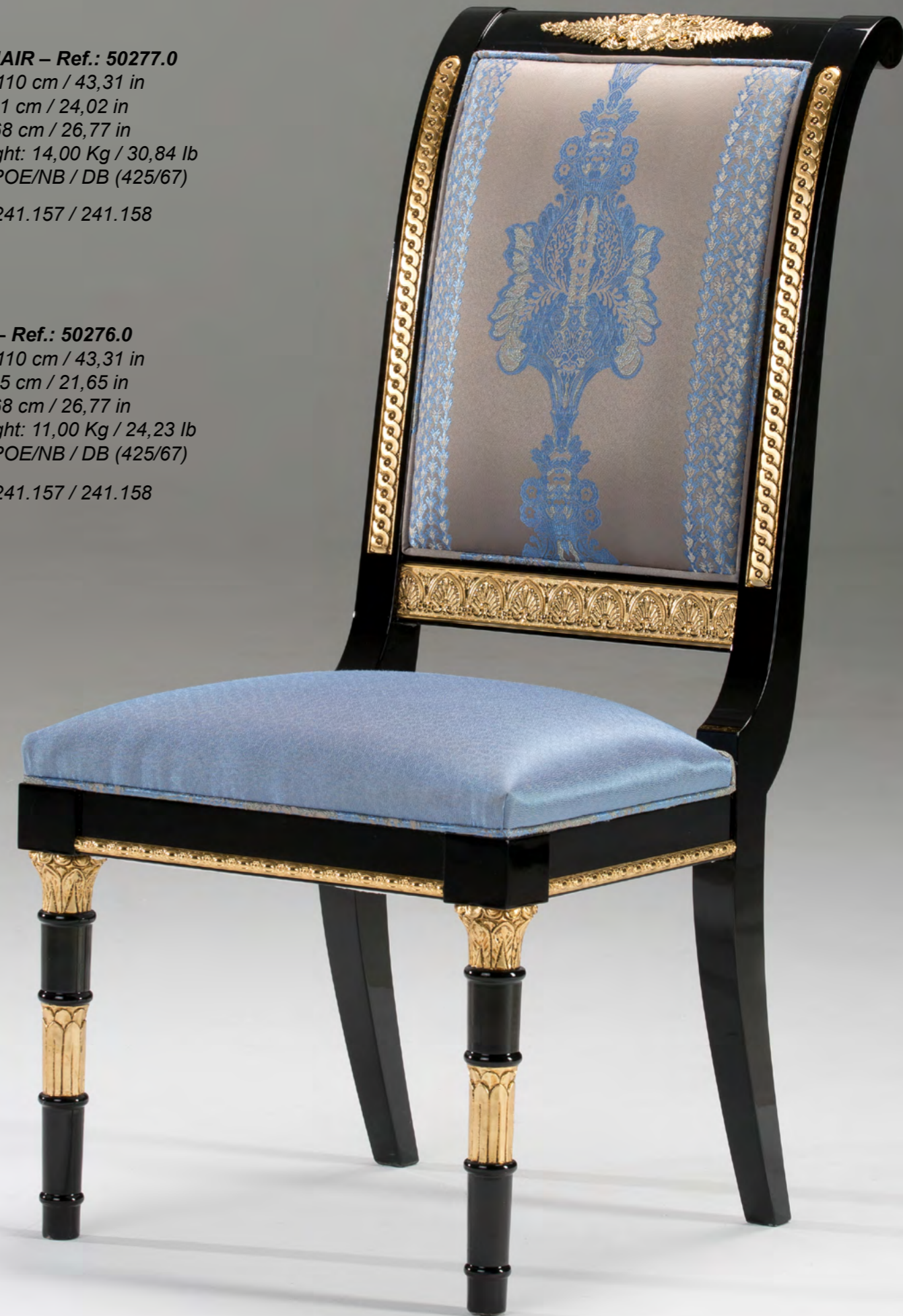
CHAIR – Ref.: 50276.0 Height: 110 cm / 43,31 in Width: 55 cm / 21,65 in Depth: 68 cm / 26,77 in Net weight: 11,00 Kg / 24,23 lb Finish: POE/NB / DB (425/67) Fabric: 241.157 / 241.158