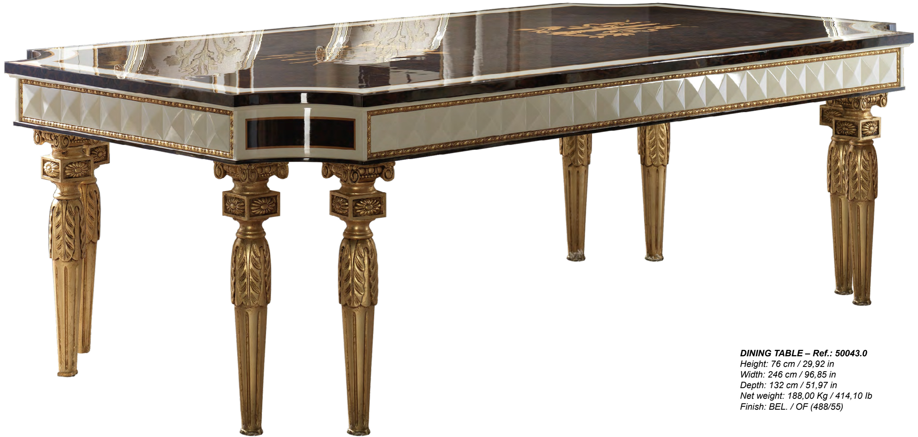
DINING TABLE – Ref.: 50043.0 Height: 76 cm / 29,92 in Width: 246 cm / 96,85 in Depth: 132 cm / 51,97 in Net weight: 188,00 Kg / 414,10 lb Finish: BEL. / OF (488/55)