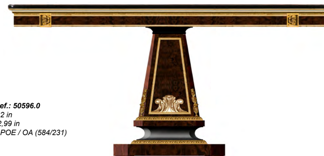
DINING TABLE – Ref.: 50596.0 Height: 77 cm / 30,32 in Width: Ø160 cm / 62,99 in Finish: Finish: NON.POE / OA (584/231)