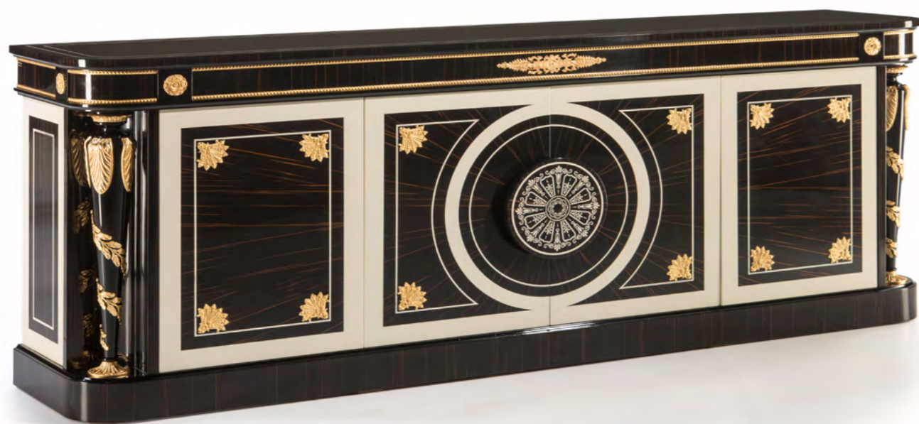
SIDEBOARD – Ref.: 50432.0