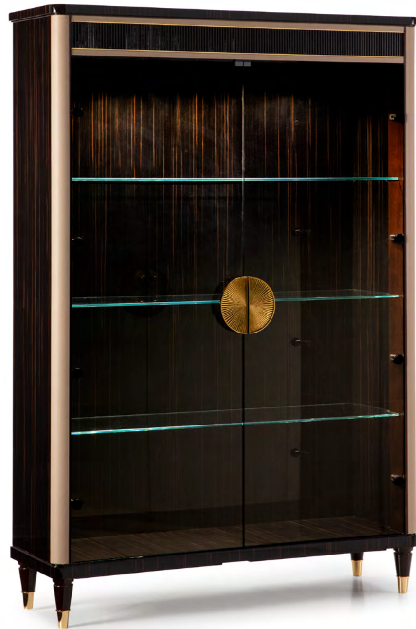
CABINET – Ref.: 50570.0 Height: 190 cm / 74,8 in Width: 130 cm / 51,18 in Depth: 40 cm / 15,75 in Net weight: 185,00 Kg / 407,49 lb Finish: MAK.B/NB /DB/OA (598/595) Leather: 250.005