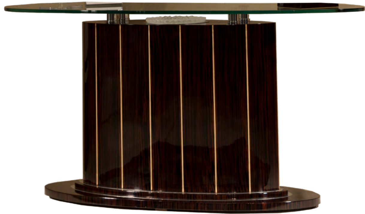
CONSOLE – Ref. 50268.0 Height: 81 cm / 31,89 in Width: 160 cm / 62,99 in Depth: 50 cm / 19,69 in Net weight: 60,00 Kg / 132,16 lb Finish: MAK.B / AC.B (486/477)