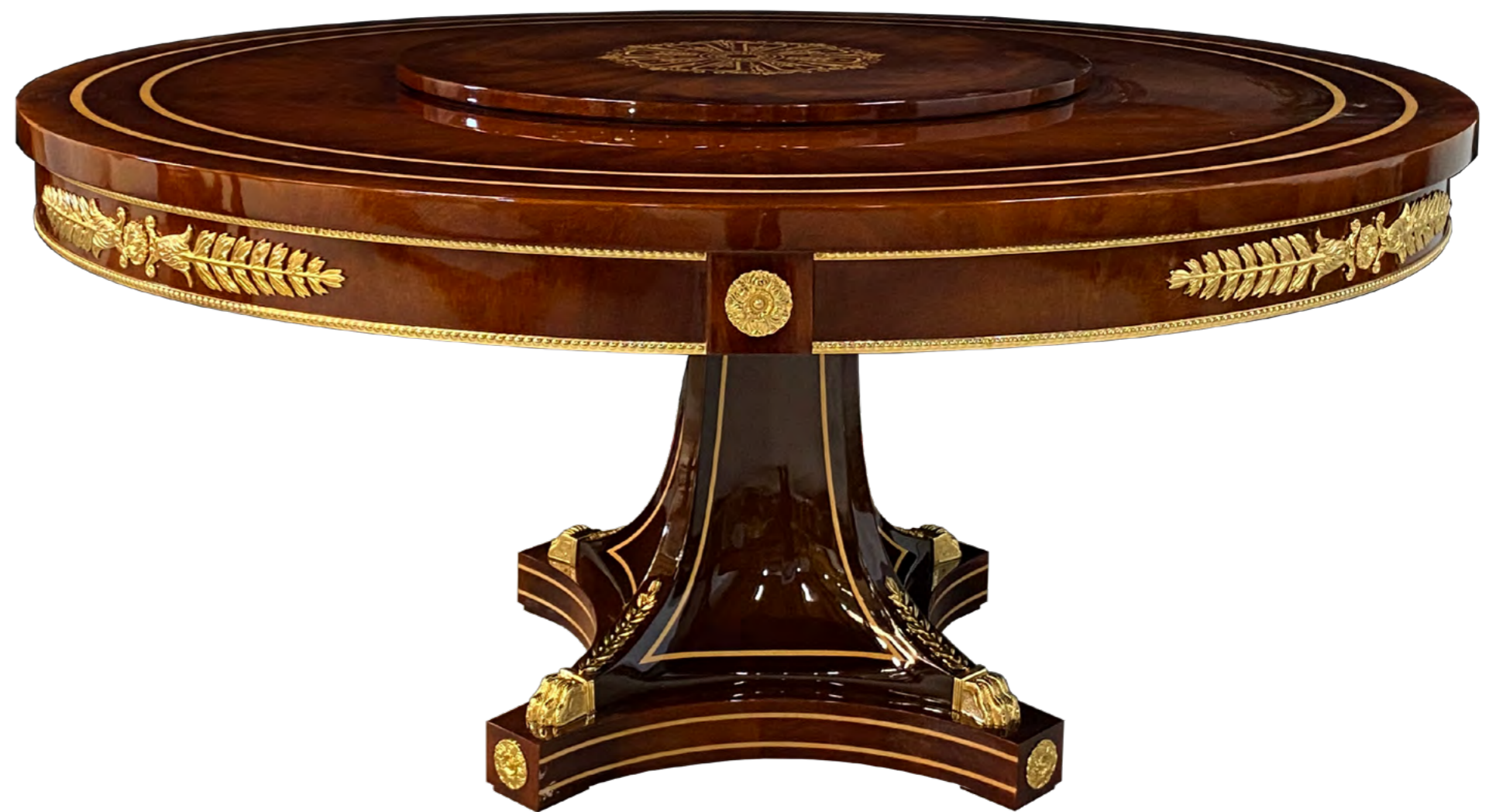
BESPOKE DINING TABLE – Ref.: 92764 Height: 81 cm / 31,89 in Width: Ø160 cm / 62,99 in Net weight: 110,00 Kg /242,29 lb Finish: CAMD.B /OA (523/231)