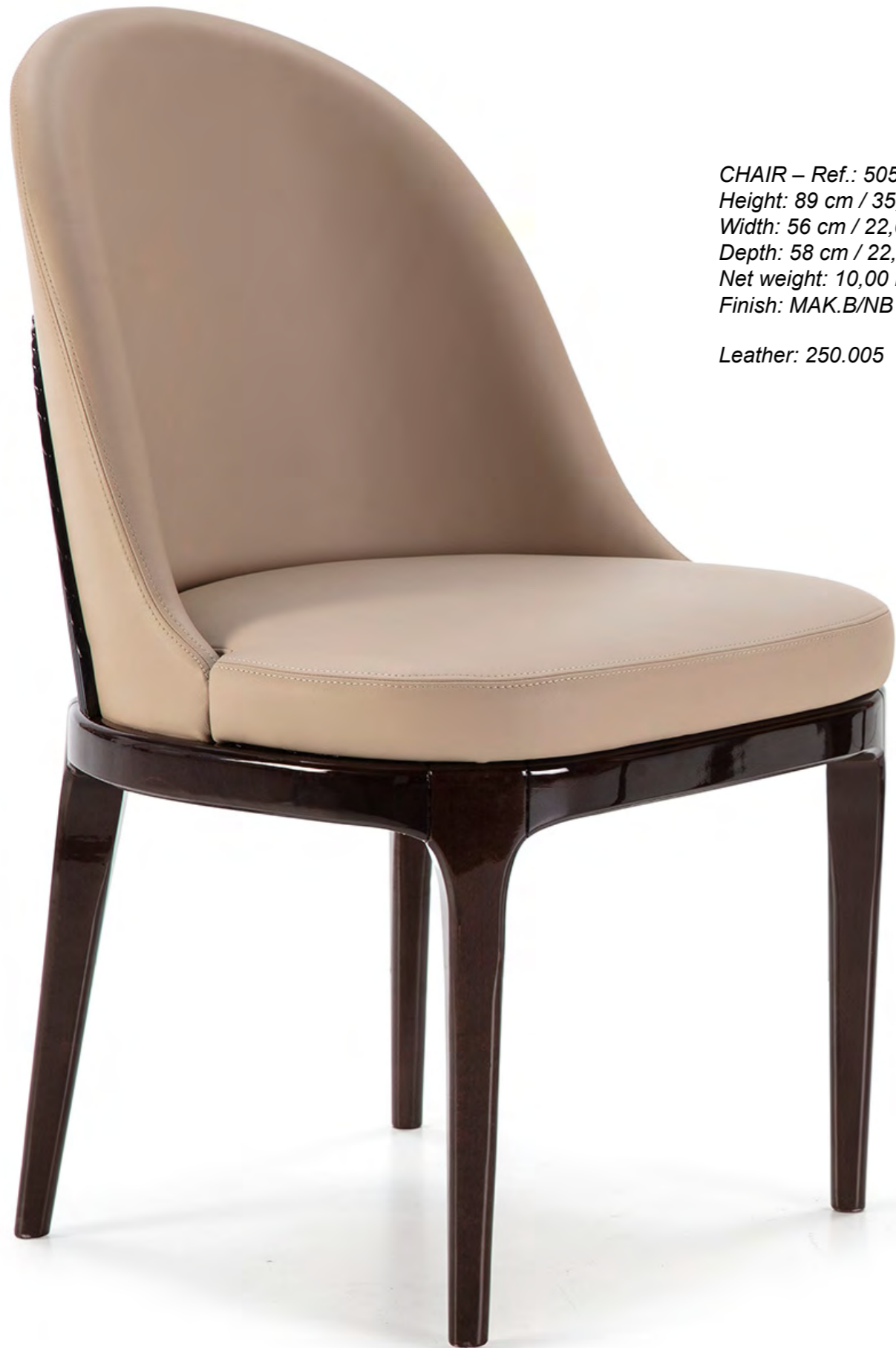
CHAIR – Ref.: 50527.0 Height: 89 cm / 35,04 in Width: 56 cm / 22,05 in Depth: 58 cm / 22,83 in Net weight: 10,00 Kg / 22,03 lb Finish: MAK.B/NB (598)