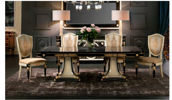
5. MALMAISON (page 94)