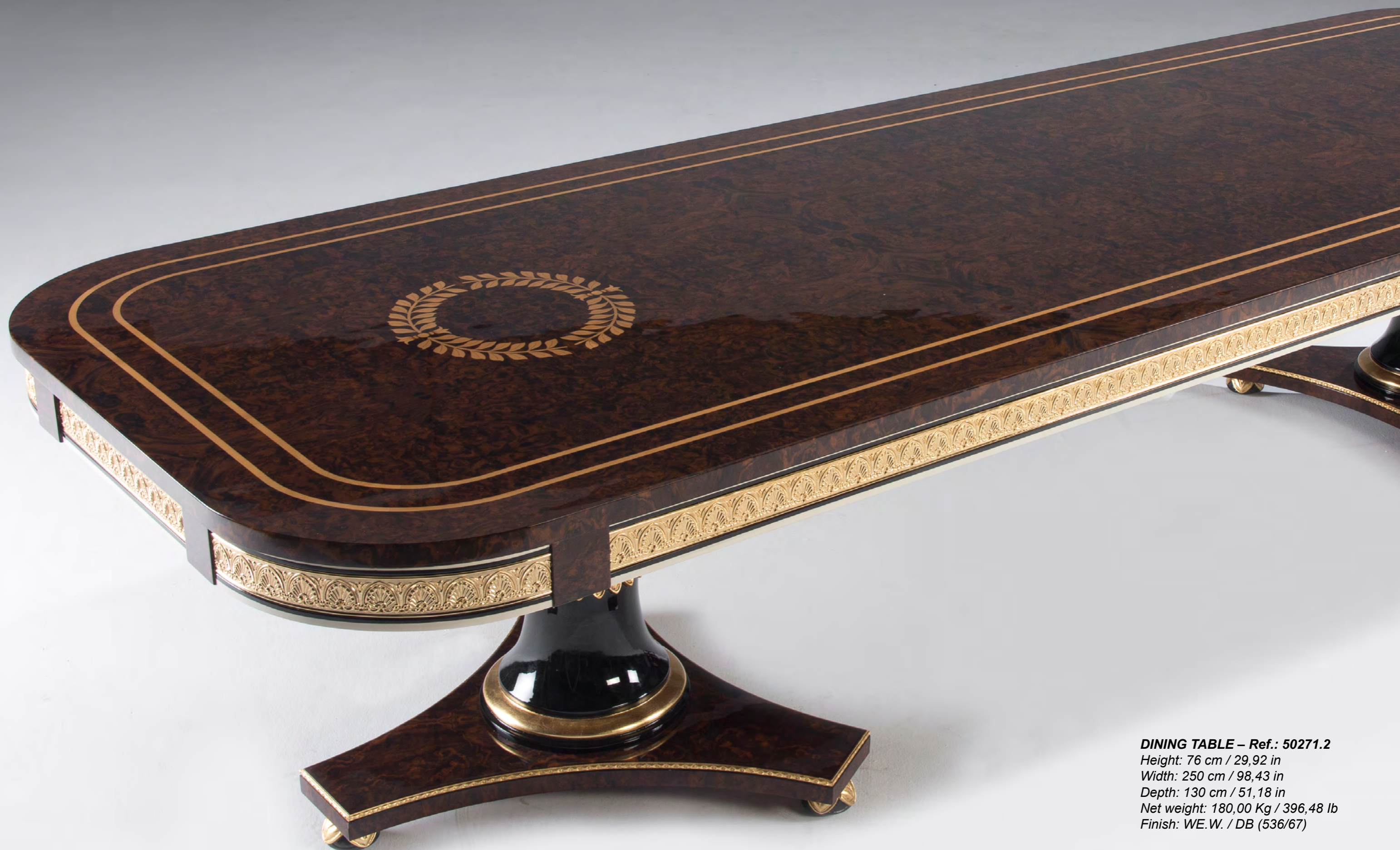
DINING TABLE – Ref.: 50271.2 Height: 76 cm / 29,92 in Width: 250 cm / 98,43 in Depth: 130 cm / 51,18 in Net weight: 180,00 Kg / 396,48 lb Finish: WE.W. / DB (536/67)