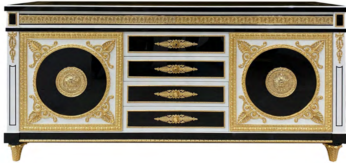
SIDEBOARD – Ref.: 50505.0