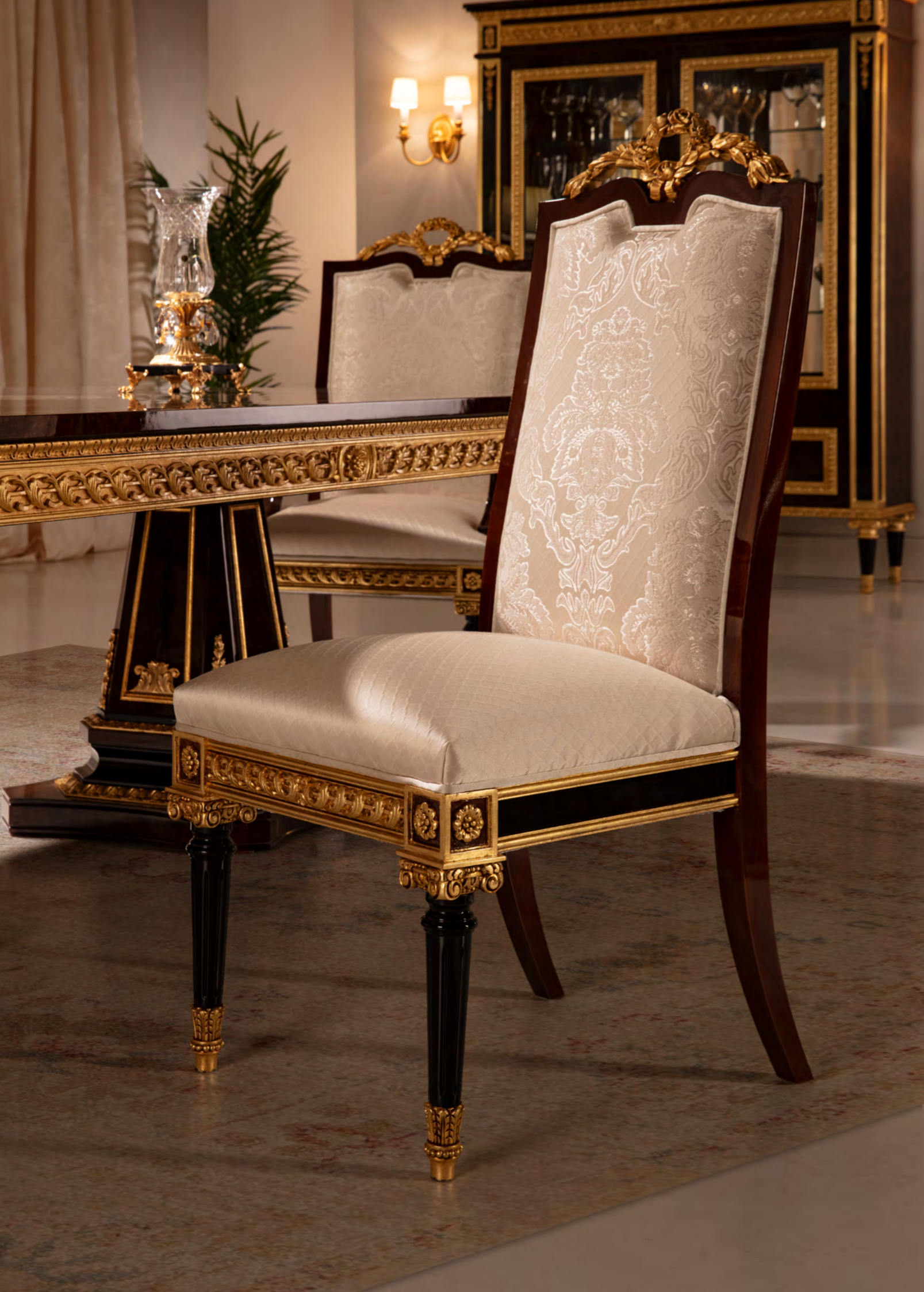
CHAIR – Ref.: 50599.0 Height: 119 cm / 46,85 in Width: 53 cm / 23,23 in Depth: 60 cm / 23,62 in Net weight: 9,00Kg / 19,84 lb Finish: NON.POE / OA (584/231)