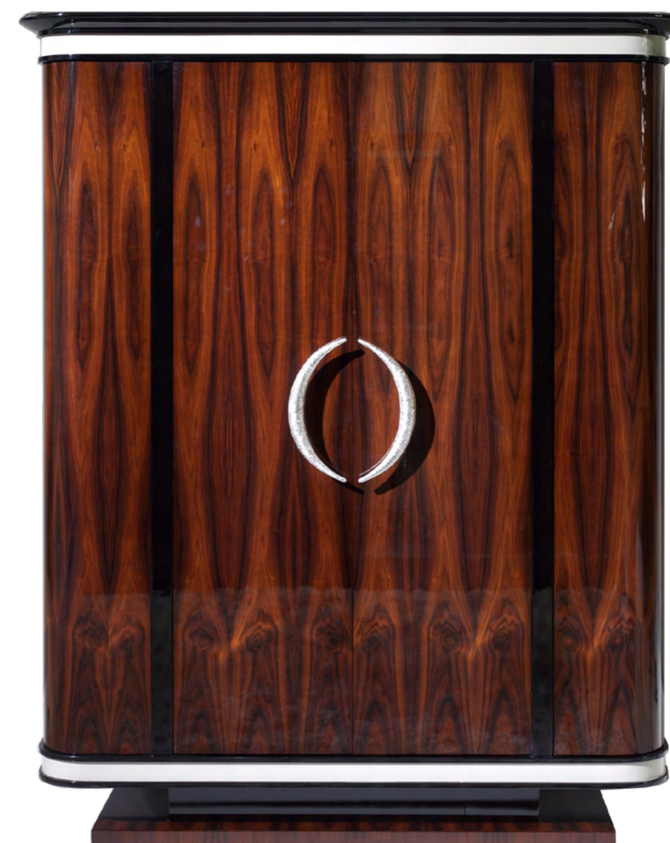
CABINET – Ref. 50196.0 Height: 166 cm / 65,35 in Width: 135 cm / 53,15 in Depth: 47 cm / 18,5 in Net weight: 165,00 Kg / 363,44 lb Finish: CA.B / PLA.B (490/4)