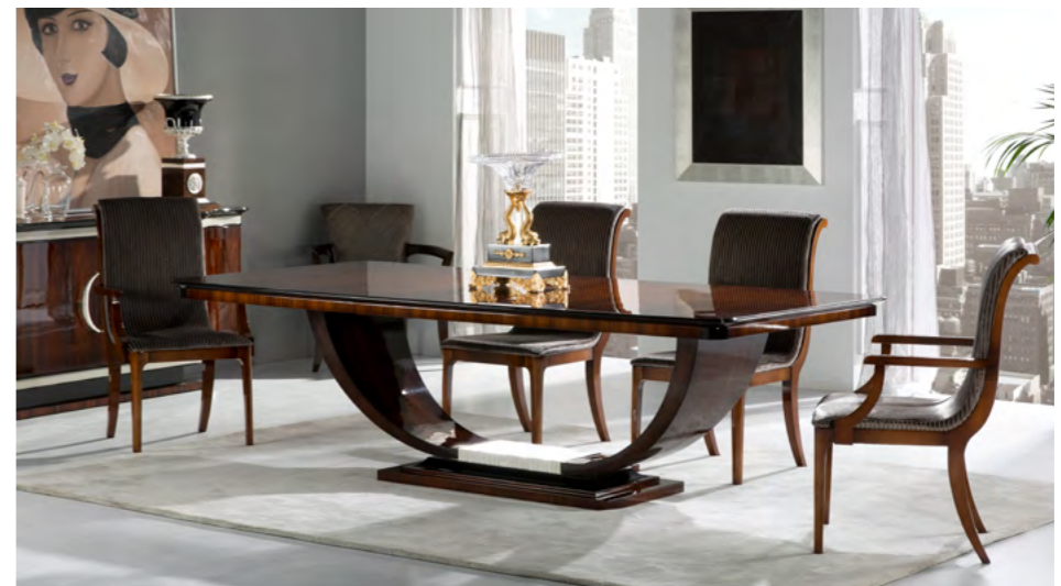
3. WILSHIRE COLLECTION ..... PAGE 190