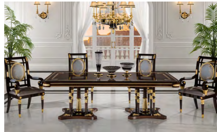
3. RIVOLI (page 42)