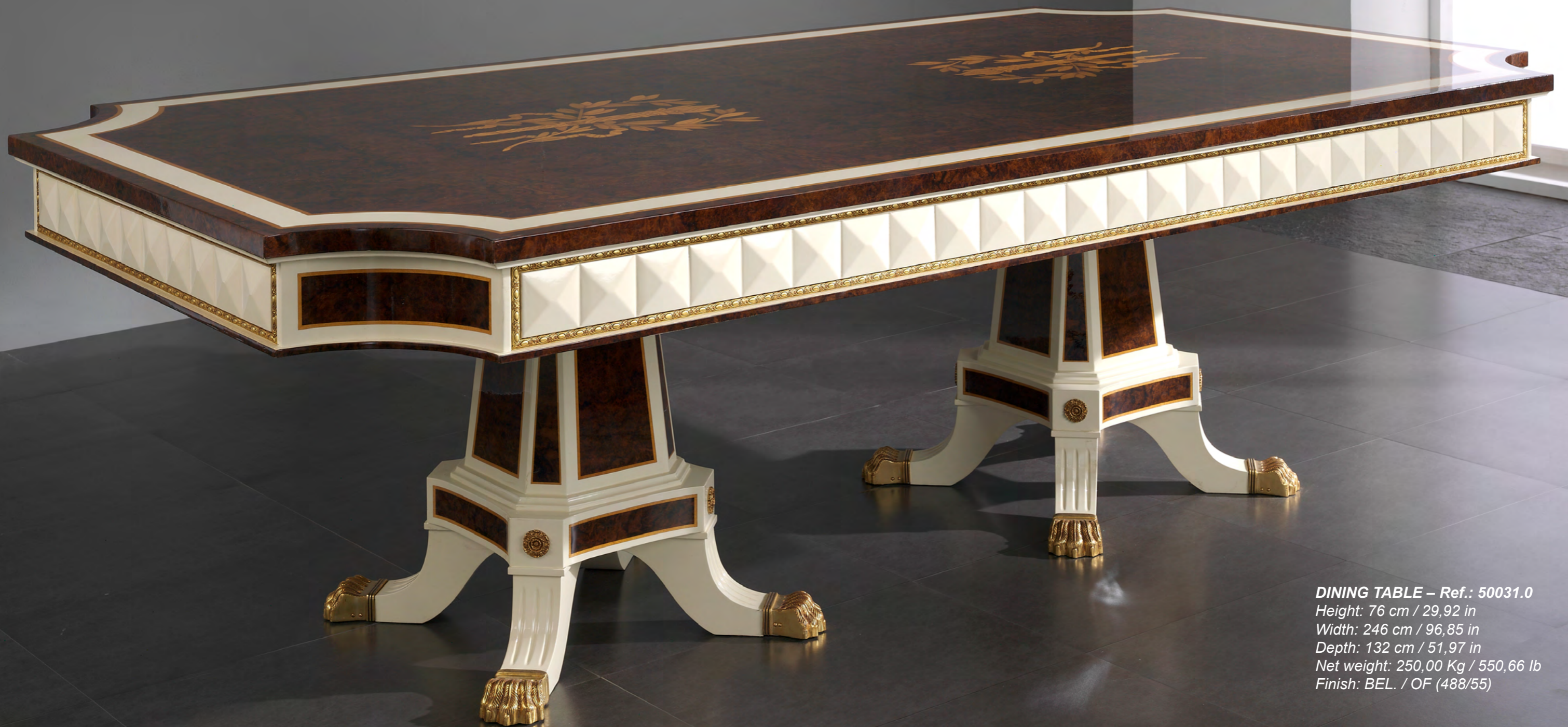
DINING TABLE – Ref.: 50031.0 Height: 76 cm / 29,92 in Width: 246 cm / 96,85 in Depth: 132 cm / 51,97 in Net weight: 250,00 Kg / 550,66 lb Finish: BEL. / OF (488/55)