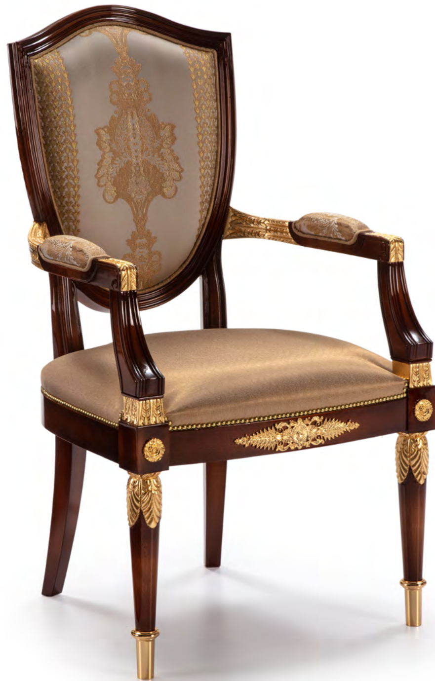
ARMCHAIR – Ref.: 50436.0 Height: 110 cm / 43,31 in Width: 57 cm / 22,44 in Depth: 67 cm / 26,38 in Net weight: 10,00 Kg /22,03 lb Finish: CAMD.B /OA (523/231) Fabric: 241.166 / 241.167